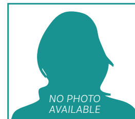
BRONWEN MALLOY COMMUNICATIONS INTERNS