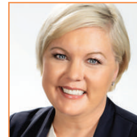
TINA BEAUDRY-MELLOR FORMER MINISTER RESPONSIBLE FOR THE STATUS OF WOMEN